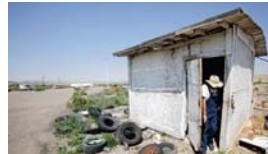
A Utah man and his ghost town: a love story