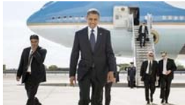
Obama getting less debate practice than Romney