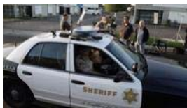
Anti-Muslim film puts Christian TV in global spotlight