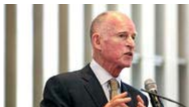
Support slips for Brown's tax hike plan