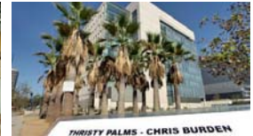
L.A. art that's less and more than it appears

Terms of Service | Privacy Policy | Los Angeles Times, 202 West 1st Street, Los Angeles, California, 90012 | Copyright 2012