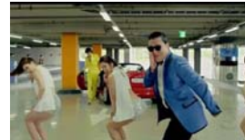
Cashing in Gangnam Style