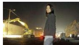
The 405's nocturnal racket of progress