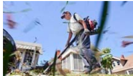
Japanese gardener one of the remaining few