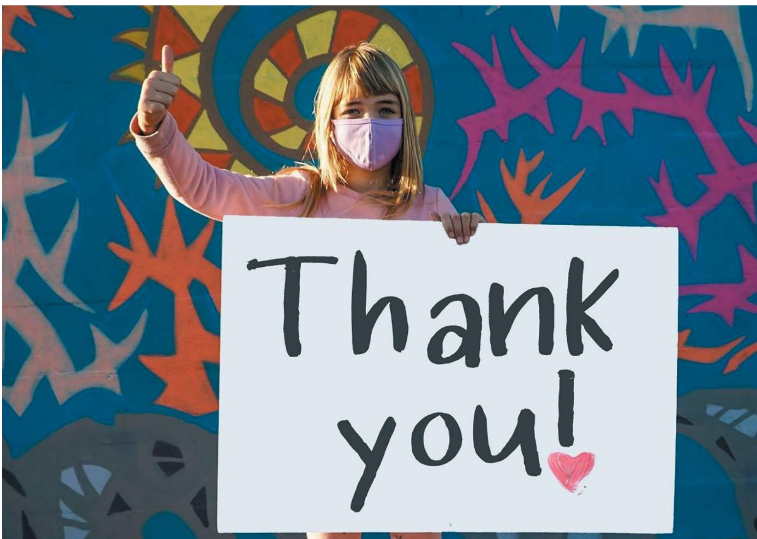
According to the Santa Monica Education Foundation, 524 donors contributed to its fundraising campaign and the money raised will fund arts programs, classroom aides, STEM and wellness programs at associated public schools.